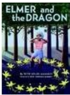
Elmer and the Dragon, Book 2 by Ruth Stiles Gannett

A boy takes along chewing gum, two dozen lollipops, a package of rubber bands, six magnifying glasses and seven hair ribbons when he goes off to Wild Island to rescue a baby dragon.