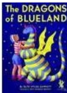
The Dragons of Blueland, Book 3 by Ruth Stiles Gannett

A stand-alone sequel to My Father's Dragon, in which Elmer Elevator and the flying baby dragon help the king of the canaries find treasure.